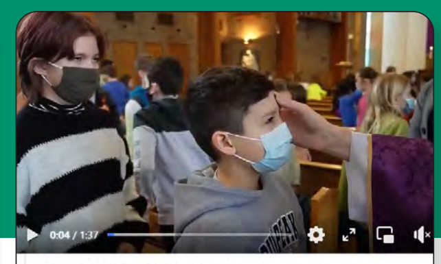
Catholic Archdiocese of Edmonton